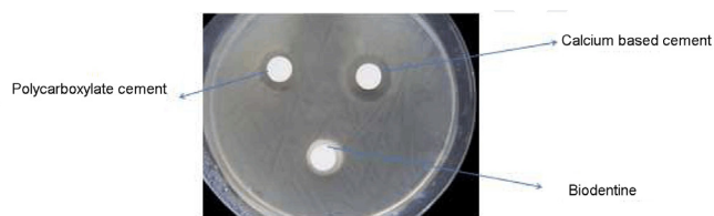
Figure 3: The zones of bacterial growth inhibition against the target microorganisms ( Enterococcus faecalis ).

at all experimental periods, it starts with pH 3.5 and after 24 hours it reaches pH 6.6.