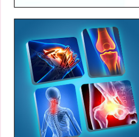
EDORIUM JOURNAL OF