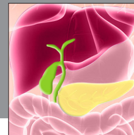
INTERNATIONAL JOURNAL OF HEPATOBILIARY AND PANCREATIC DISEASES